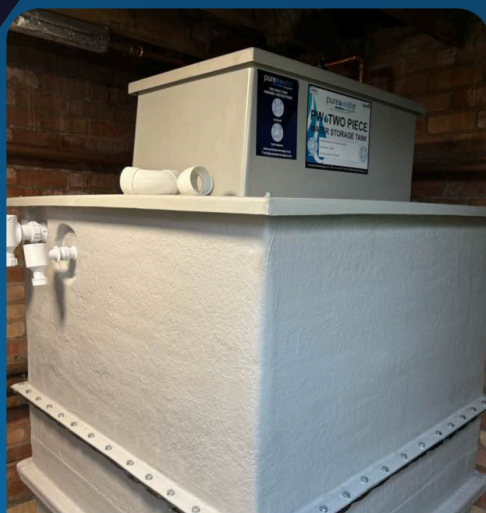
New water storage tank